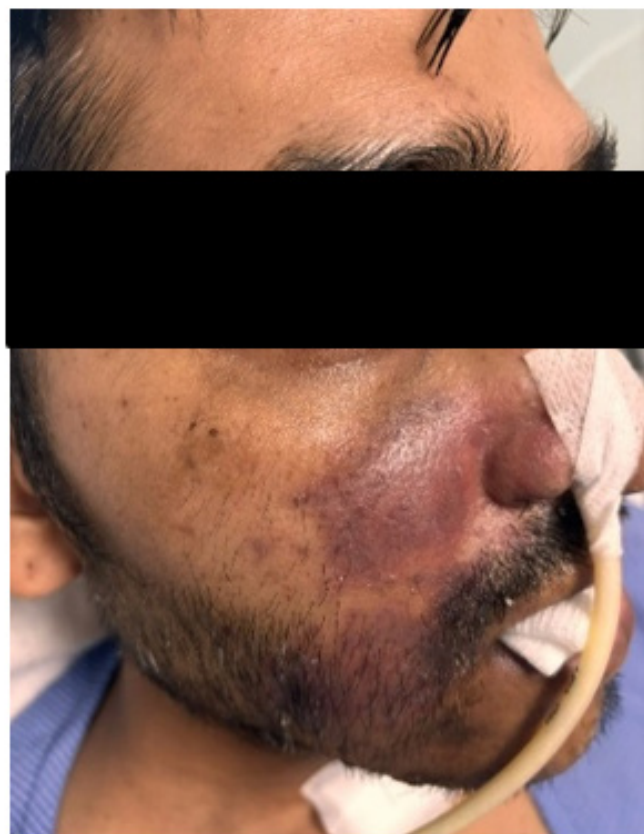
Figure 1: Non-pruritic erythematous maculopapular rash on the right cheek and perioral region noted during polymyxin B therapy. The rash was limited to the facial region and gradually resolved after discontinuation of the drug.

Our patient developed a non-pruritic, non-vesicular facial maculopapular rash on Day 4 of treatment, which resolved promptly after discontinuation of polymyxin B. The localized rash, without systemic manifestations, aligns with previously reported delayed-onset cutaneous reactions to polymyxin B, potentially